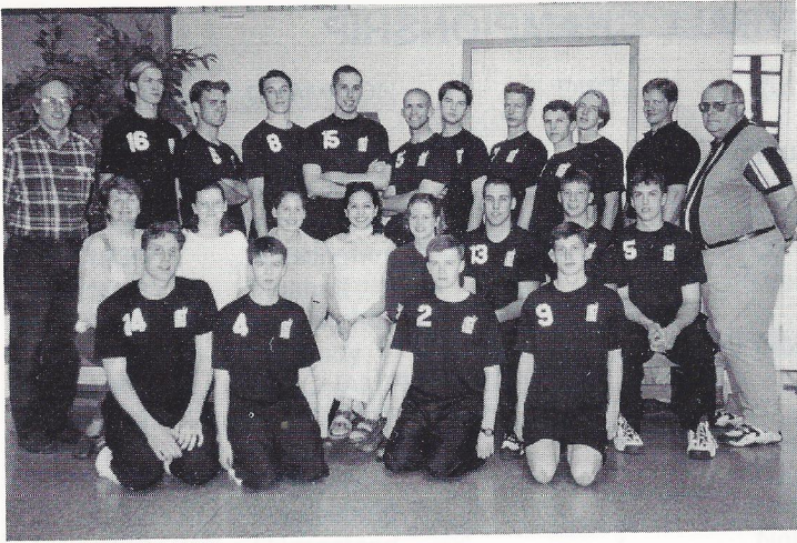
CENTRAL YORK HIGH SCHOOL--PIAA DISTRICT III CHAMPION--RECORD: 17-4