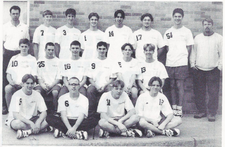
PARKLAND HIGH SCHOOL –PIAA DISTRICT XI CHAMPION–RECORD: 18-2