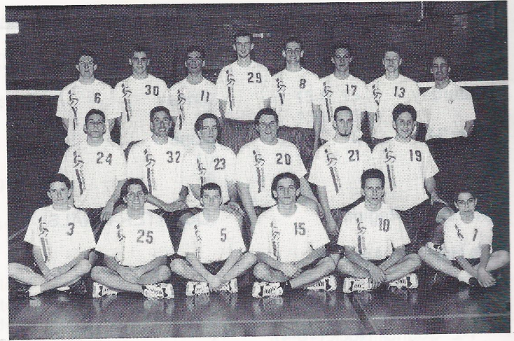
BALDWIN HIGH SCHOOL--PIAA DISTRICT VII RUNNER-UP--RECORD: 13-4